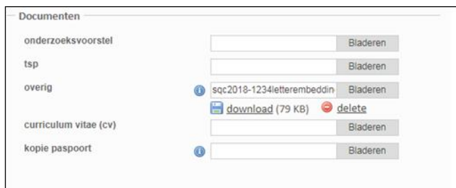
Figure 1. Uploading your research embedding letter in Hora Finita

Every (PhD) research project that will be carried out within APH needs to be registered at the Scientific Quality Committee (SQC) by the principal investigator or project leader. The submitted research project will be judged by the relevant APH program leaders on suitability and relevance to the preferred research program. Following positive judgement, the principal investigator or project leader will receive a research embedding letter from the SQC. To ensure that the PhD research project is embedded, the research embedding letter must be submitted in Hora Finita in the box 'overig' (see Figure 1). For more information regarding the embedding procedure, please click here .